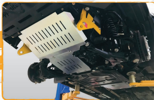
Part Number BP101-3PACK Ford Ranger PX3 - First, second & third plate pack Barcode 9319478660953 RRP* $475.00