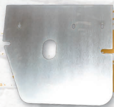
Part Number BP101-3 Ford Ranger PX3 - Third Plate Barcode 9319478660717 Fits at the end of the third (factory) bash plate for Transfer case protection RRP* $149.00