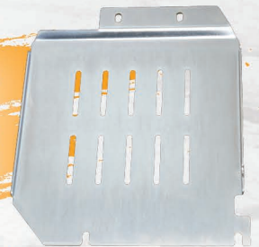
Part Number BP101-2 Ford Ranger PX3 - Second Plate Barcode 9319478660700 RRP* $149.00