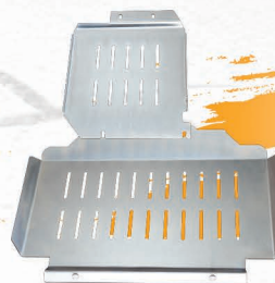
Part Number BP101-2PACK Ford Ranger PX3 - First & second plate Barcode 9319478661059 RRP* $349.00