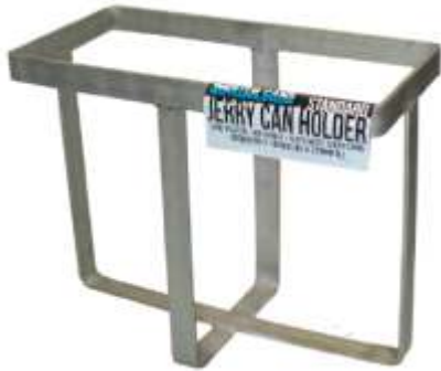
MC-JCH20 Jerry Can Holder - Heavy Duty Weld On or Bolt On. Zinc Plated Finish. Size - 370mm(L) x 180mm(W) x 300mm(D) Made from fully welded 28mmx5mm Steel Carton Qty - 1