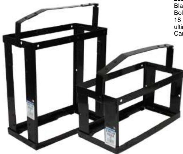
MC-JCH10A 10Ltr Jerry Can Holder Black Powder Coated. Bolt On, Locakable hinged bar. 18 x Protective rubber pads for ultimate protection of your can. Carton Qty - 1