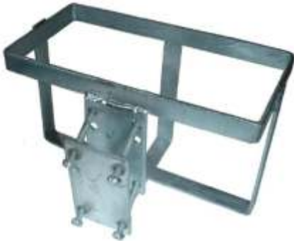
MC-JCH20B Jerry Can Holder Mounts to Draw Bar Mounting suits draw bars 75-100mm Hot dipped Galvanised Finish. Size - 370mm(L) x 180mm(W) x 300mm(D) Carton Qty - 1