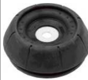
S5463R Astra Strut Top Mount - 90468554