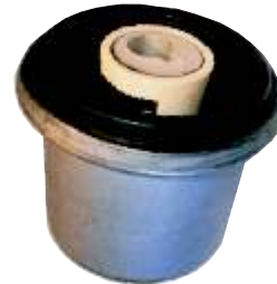
S1937R AU-BF Front C/Arm Lower Front