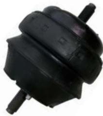
S5651HR BA-BF Engine Mount - Hydraulic