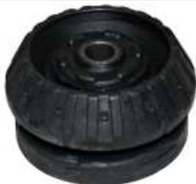
S2650R Commodore Strut Top Mount