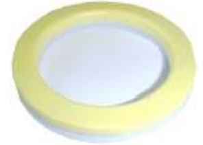
S3024B Astra Strut Top Bearing