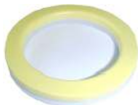
S2651 Commodore Strut Top Bearing