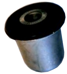
S1938R AU-BF Front C/Arm Lower Rear