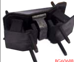
S9750R BA2-FG 4S Auto Trans Mount