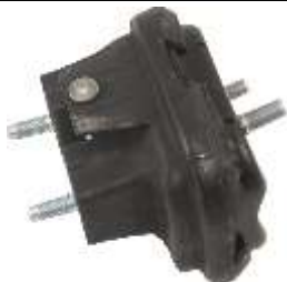
S2645HR VN-VY Engine Mount - Hydraulic