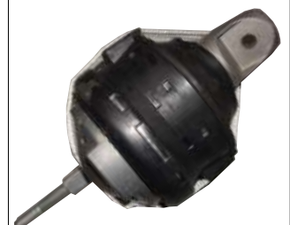
S9751R FG Front Engine Mount