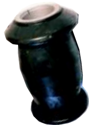
S0398R EF-BF Front Lower Shock