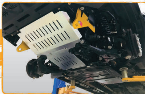
Part Number BP101-3PACK Ford Ranger PX3 - First, second & third plate pack Barcode 9319478660953 RRP* $475.00