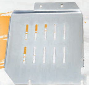
Part Number BP101-2 Ford Ranger PX3 - Second Plate Barcode 9319478660700 RRP* $149.00