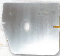
Part Number BP101-3 Ford Ranger PX3 - Third Plate Barcode 9319478660717 Fits at the end of the third (factory) bash plate for Transfer case protection RRP* $149.00