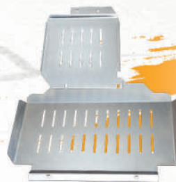
Part Number BP101-2PACK Ford Ranger PX3 – First & second plate Barcode 9319478661059 RRP* $349.00