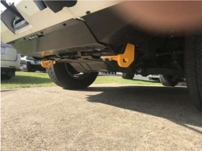
Pic #6 A brake away view of the M12x140 bolt in from the front of the chassis. This is missing the front chassis plate for illustration purposes.