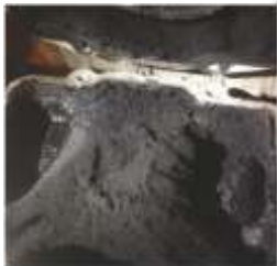
Toyota 1VD manifold