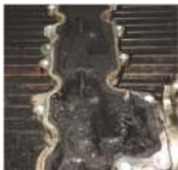
Triton inlet manifold

*In installations where oil is returned to the sump