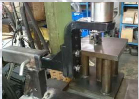
Test Jig in Action

Ask your Representative for more information