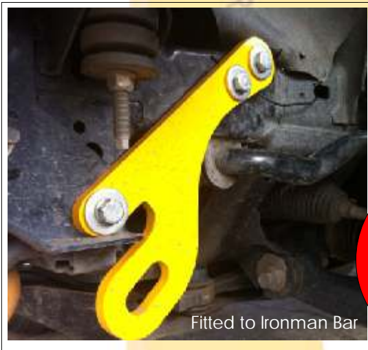
Fitted to Ironman Bar

Due to customer fitment issues, we have modified the RP-PRA150 to suit for the TJM T13 Outback Bar. Due to this modification, the new destruction testing on the revised point resulted in a lower load to be applied before deformation. Subsequently the WLL on these points has been altered to 3250kgs per point. Due to the nature of the tow point components, and the way in which they could be used by untrained enthusiasts - safety is our highest priority. Setting a destruction tested WLL is a major part of encouraging safe use of these components within tested straight line pull load limits.