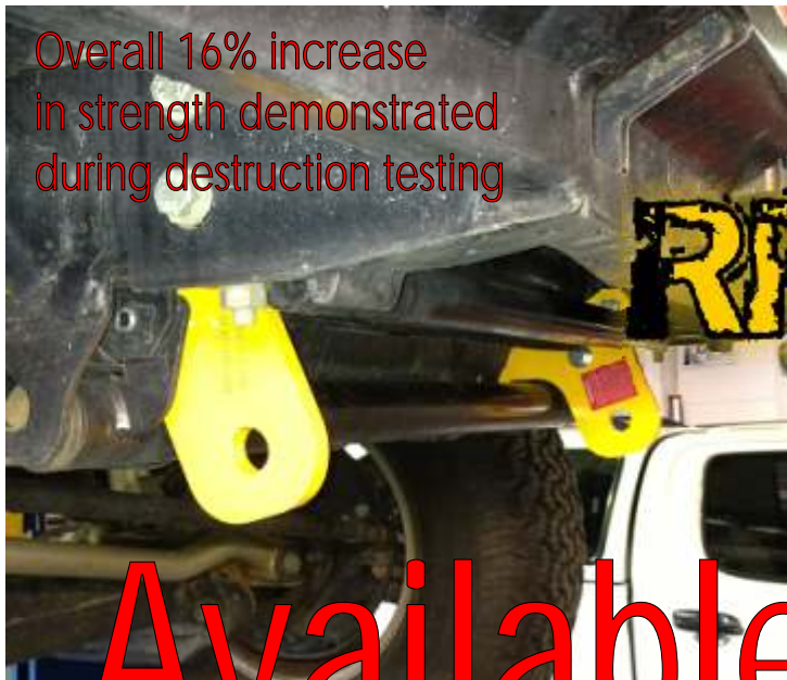
Overall 16% increase in strength demonstrated during destruction testing