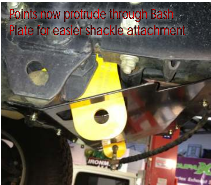
Points now protrude through Bash Plate for easier shackle attachment

Roadsafe have upgraded the size and length of the replacement Tow Point to suit to the 70 Series Cruisers. This upgrade has been undertaken to allow for the point to protrude further through the bash plate, to allow easier shackle attachment for recovery situations.