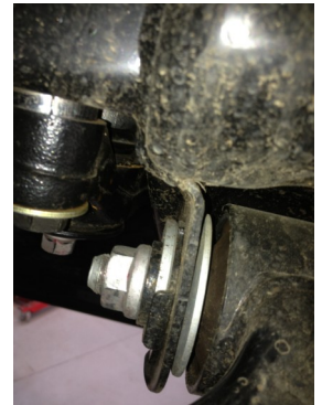
Shows small 6mm spacer installed into diff mount under passenger side of vehicle (side view)

Red dot indicates the larger main diff drop spacers and bash plate mount, inc new bolts.