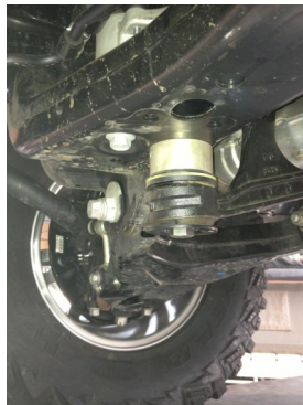
Close up of drivers side main spacer