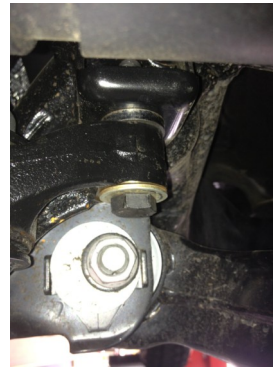
6mm spacer installed into diff mount under passenger side of vehicle