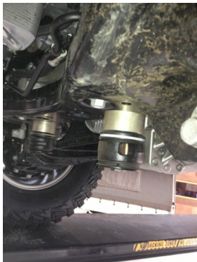
Shows Two Main Spacers installed from rear view

Suitable for Landcruiser 200 Series. Designed to allow for the front diff to be lowered by 25mm, thus reducing the angles CV Joints need to operate on.—Suitable for vehicles with KDSS and 2016 models.