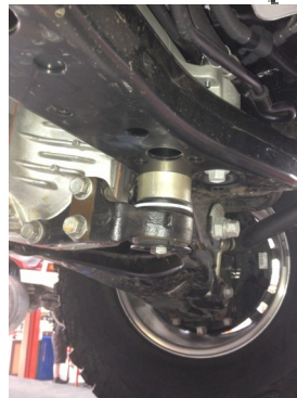
Close up of passenger side main spacer