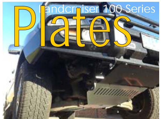
Landcruiser 100 Series